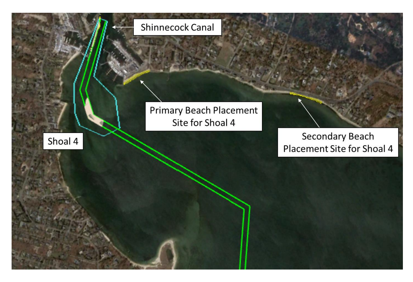
Figure 3: Dredging and Placement Location Map Shoal 4 (Not to scale)