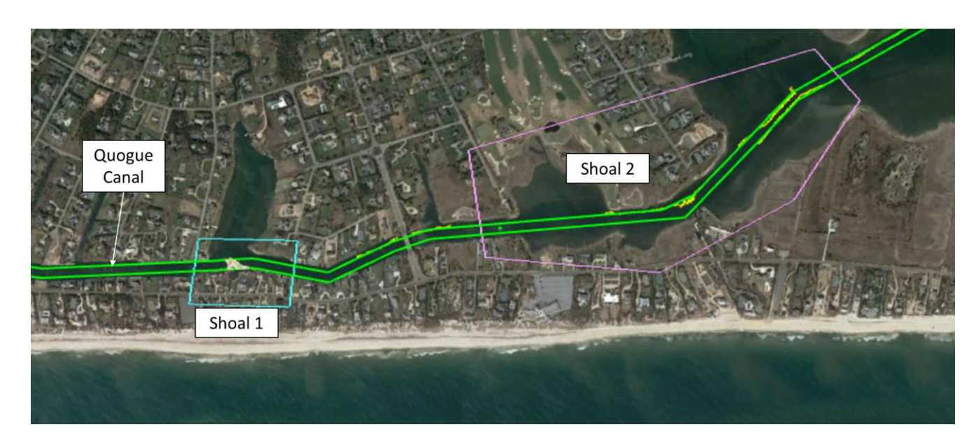
Figure 1: Dredging Location Map Shoals 1&2 for Upland Placement (Not to scale)