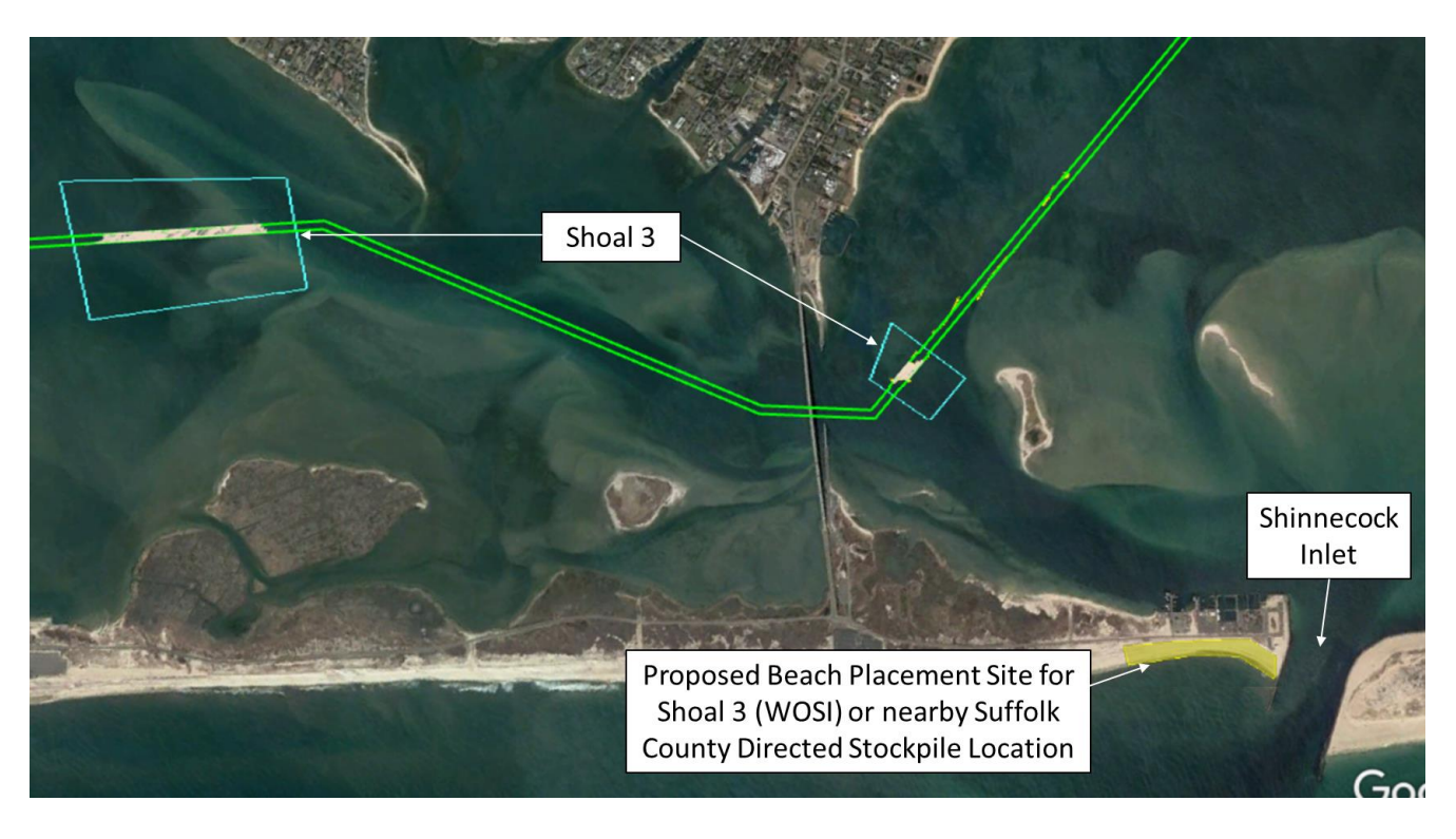
Figure 2: Dredging and Placement Location Map Shoal 3 (Not to scale)