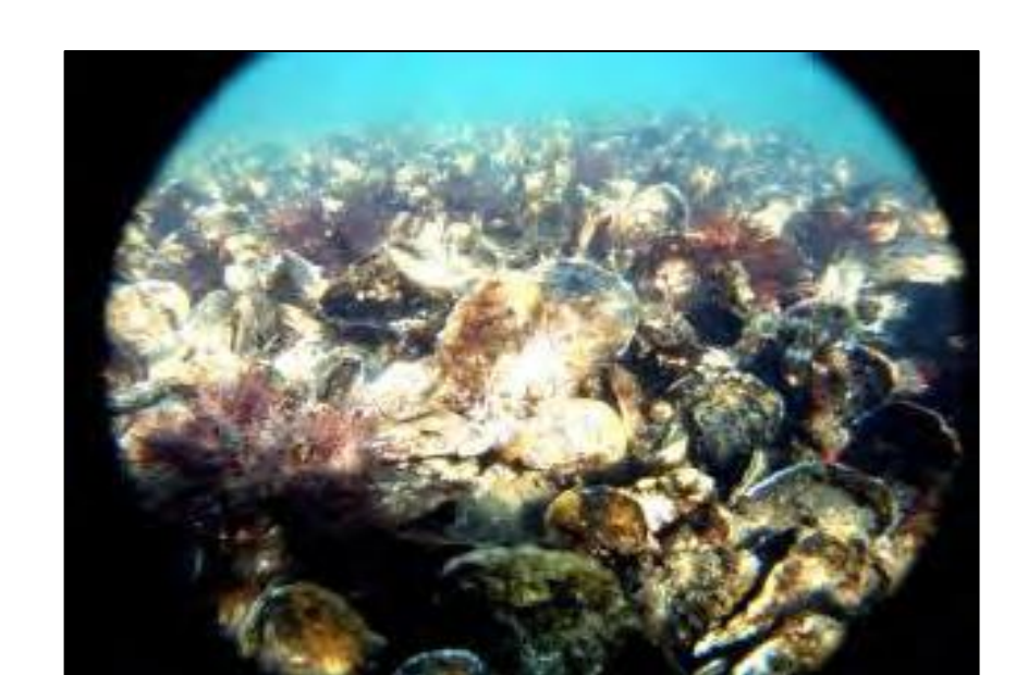
Spat on Shell