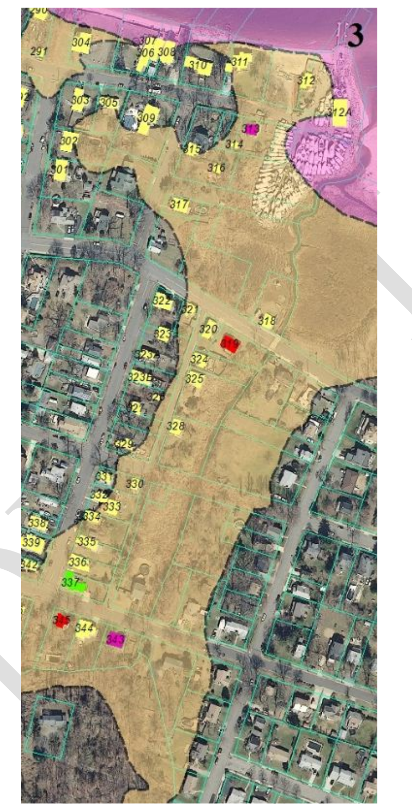
Figure 4: Leonardo TSP structures - Group 3