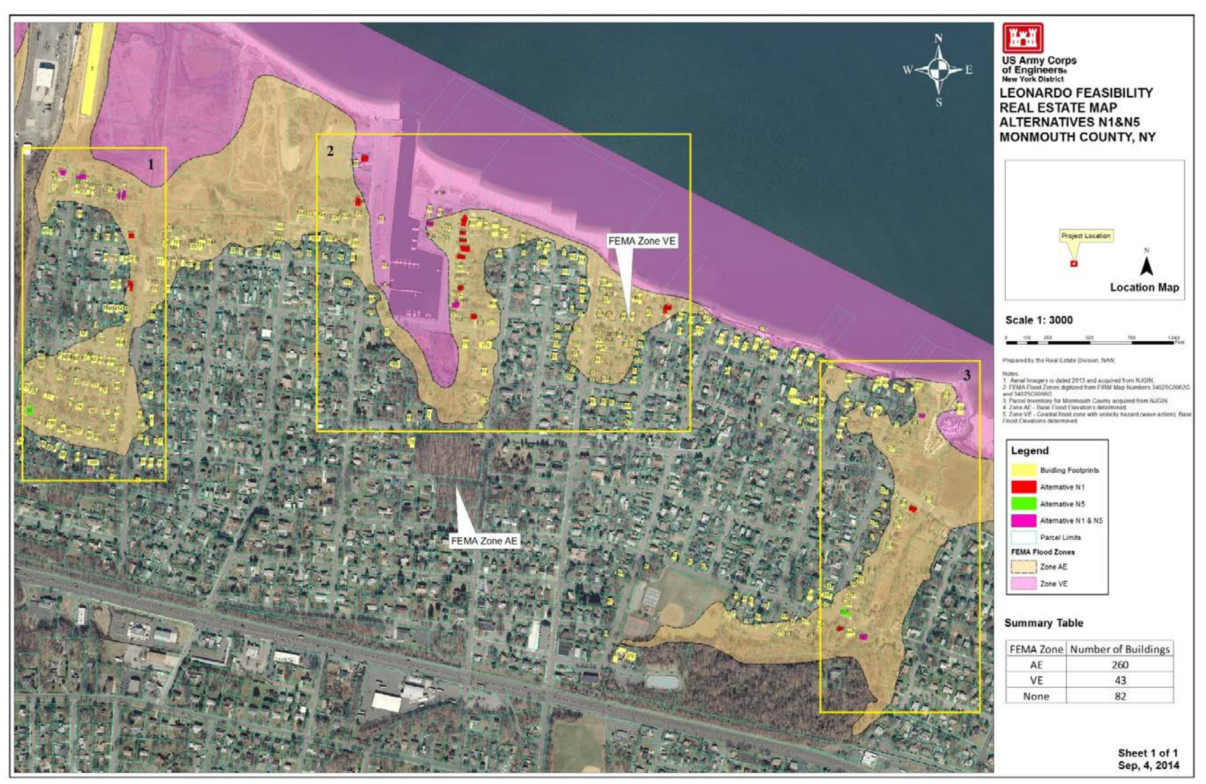
Figure 1: Leonardo TSP overview of structures