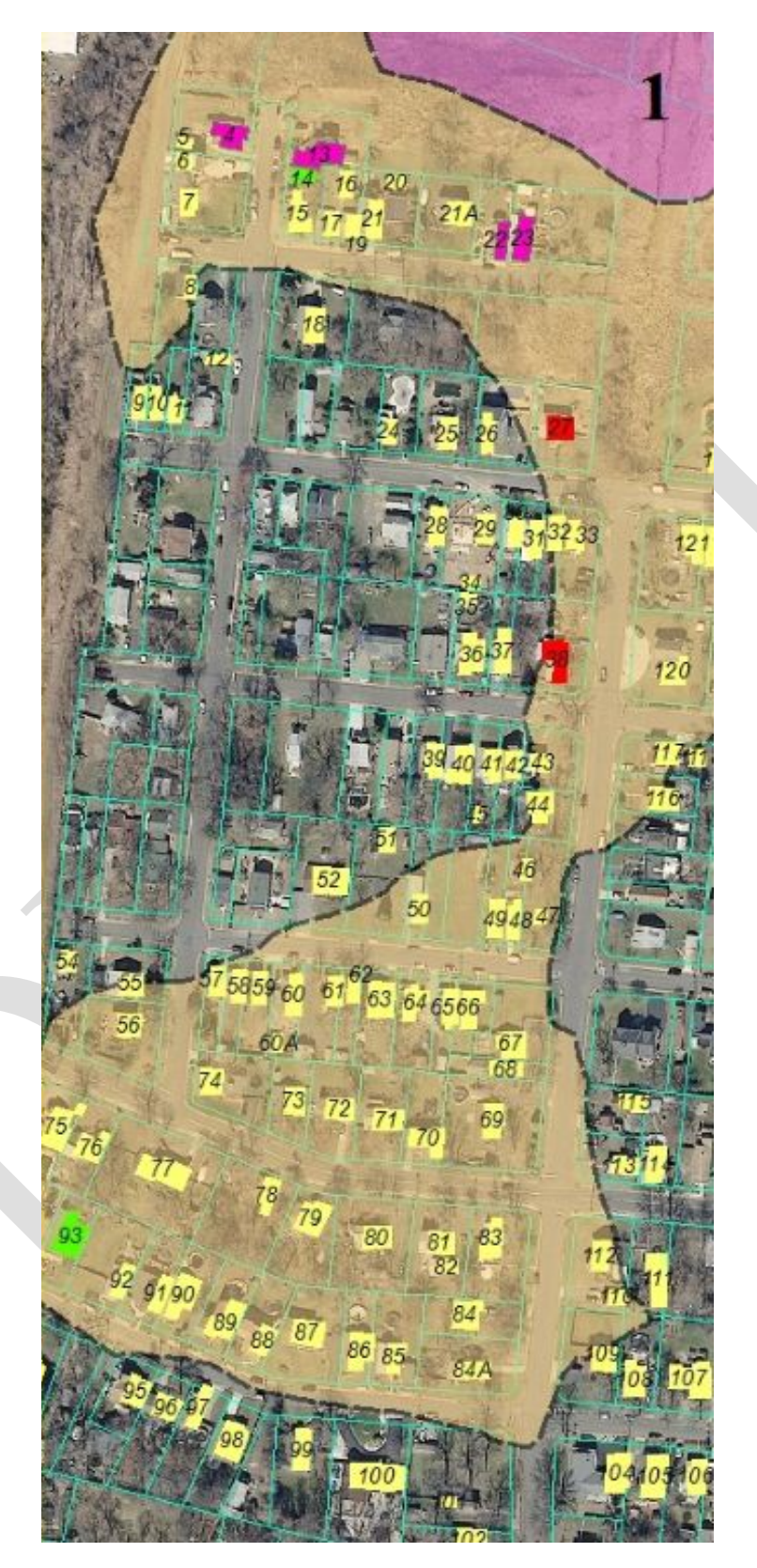
Figure 2: Leonardo TSP structures - Group 1