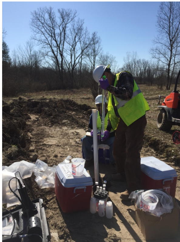
Photograph 6 – Water Sampling from Silo #5