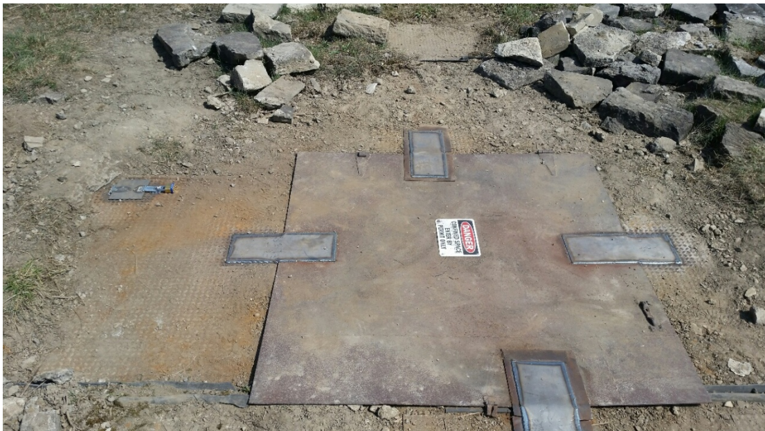
Photographs 11 & 12 – Securing Silo Sampling Access Holes