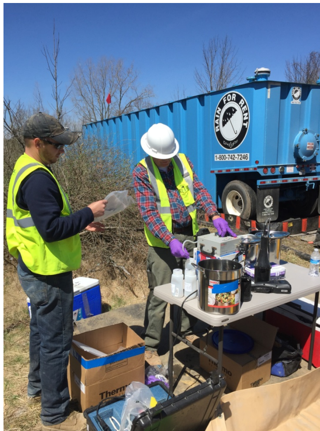
Photographs 9 & 10 – Collecting Composite Water Sample during Silo #2 Pump Test.