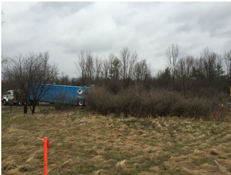
Photograph 3 – Looking north from Silo #1. Mobilization of Steel Tanks.