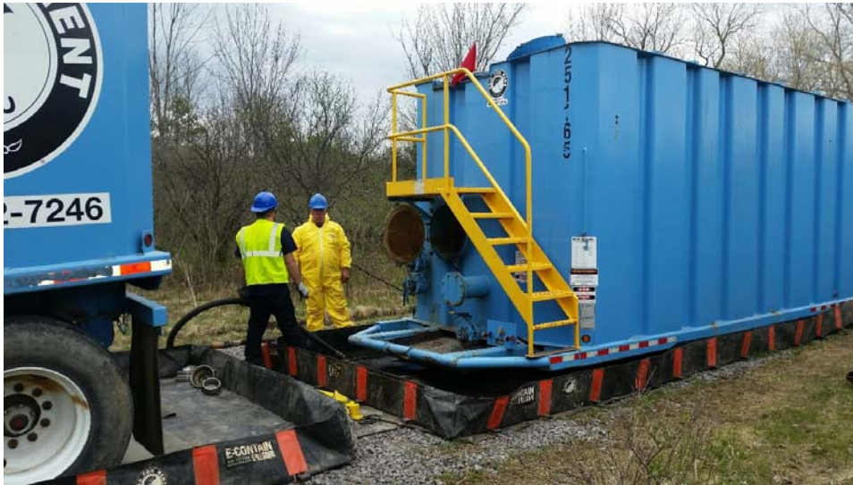
Photograph 13 – Cleaning Steel Tanks