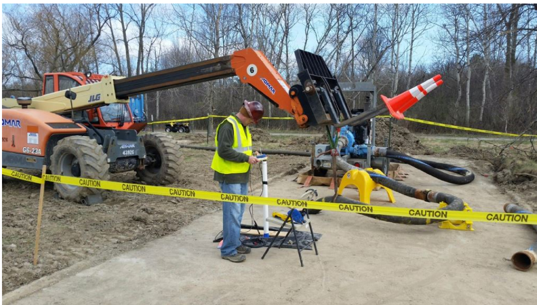
Photograph 8 – Implementing Pump Test at Silo #2.