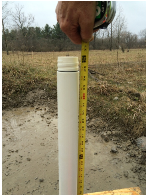
Photographs 4 & 5 – Installation of Drop Sampling Tubes