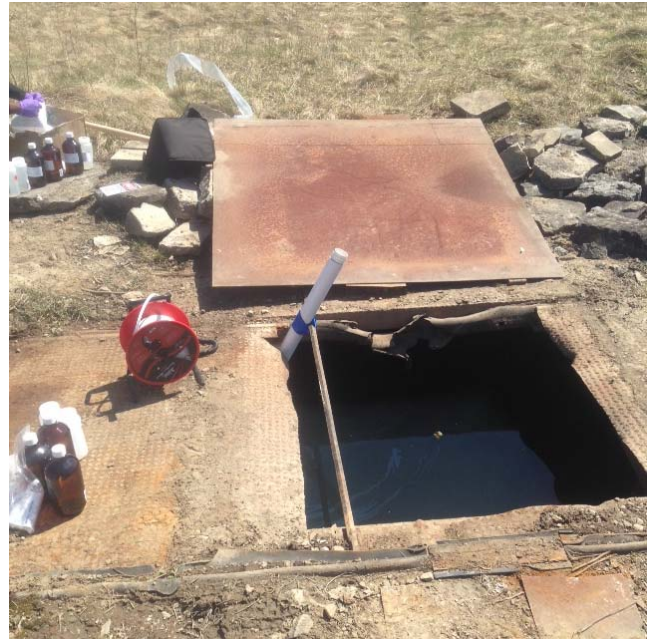
Photographs 1 & 2 - Silo #1 Water Sampling for Waste Characterization.