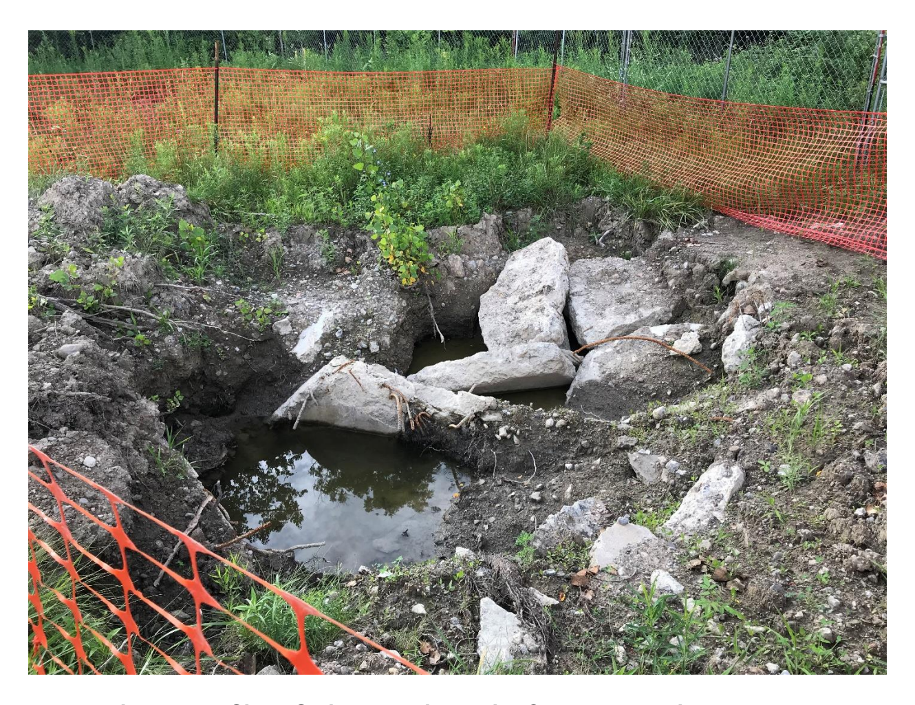
Figure #2 – Silo 6 Stair Entry Filled with Concrete Debris and Water