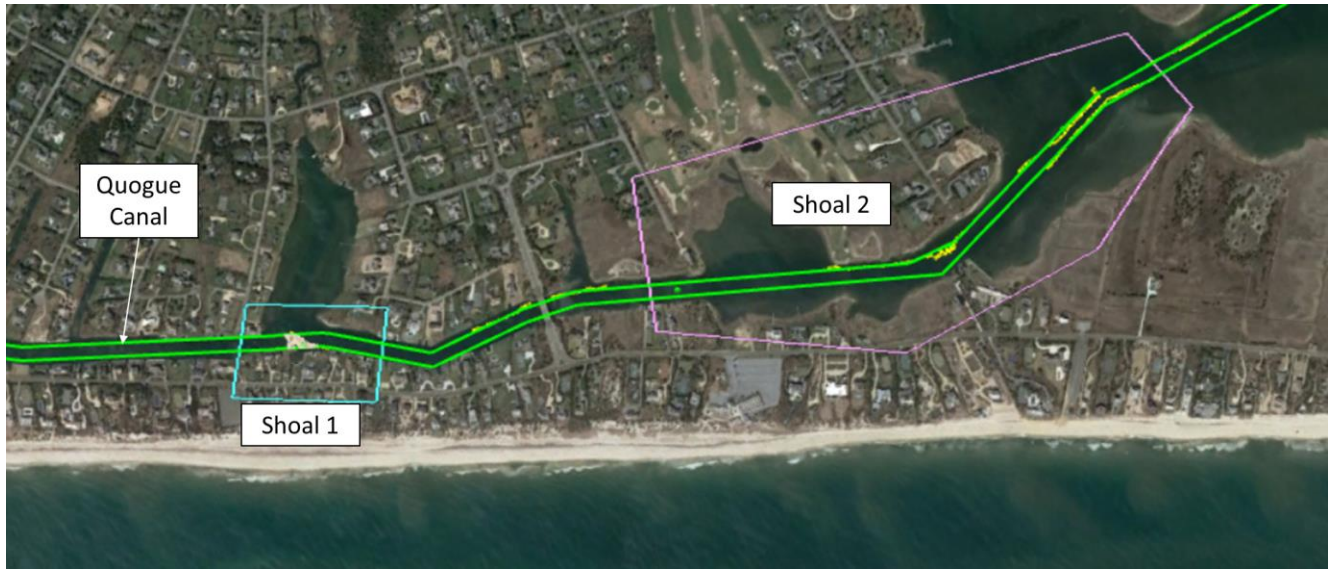
Figure 1: Dredging Location Map Shoals 1&2 for Upland Placement (Not to scale)