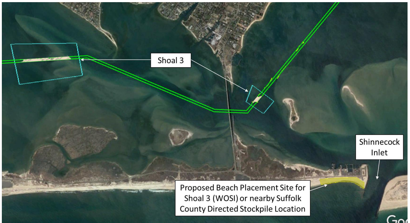
Figure 2: Dredging and Placement Location Map Shoal 3 (Not to scale)