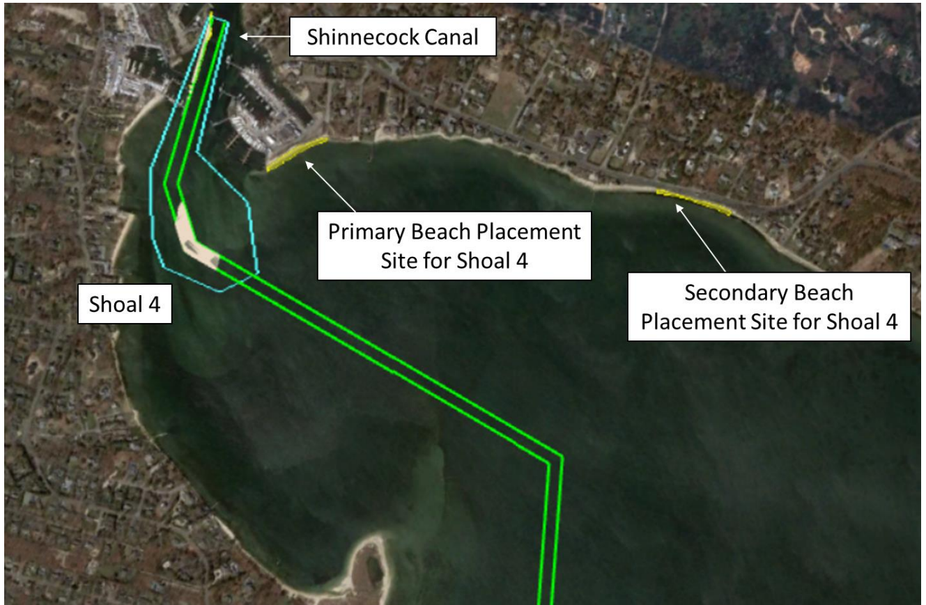
Figure 3: Dredging and Placement Location Map Shoal 4 (Not to scale)