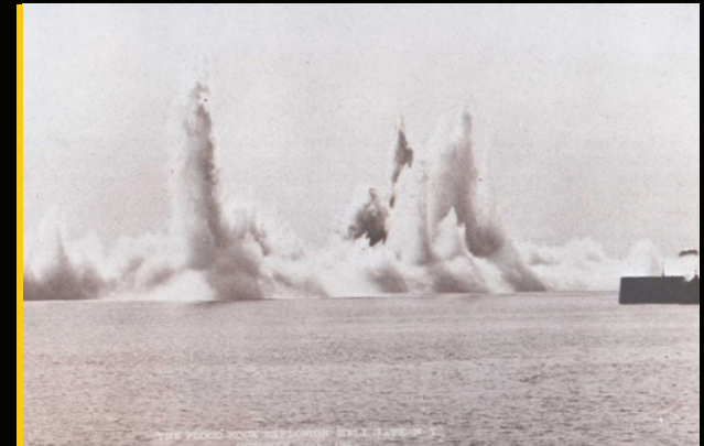
1885 explosion to remove dangerous rocks at Hell Gate in the East River, an area that caused over $2 million worth of damage to shipping annually.