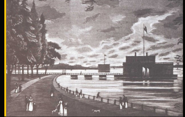
New York Harbor defenses during the Revolutionary War.

In the 1820s, Congress delegated the water resource mission to the Corps, which brought the organization into the civil works arena. One of the most prominent early projects in New York was the Hell Gate navigation project. In the 1850s, an average of 1,000 ships ran aground every year at Hell Gate, a dangerous spot in the East River running from 90th to 100th Street in Manhattan. To fix the problem, the Corps set off huge underwater explosions to demolish many of the rocks, and hired contractors to remove debris by grappling. The second of these blasts, in 1885, was the largest man-made explosion at the time and firmly established the Corps' importance to the civil works mission.