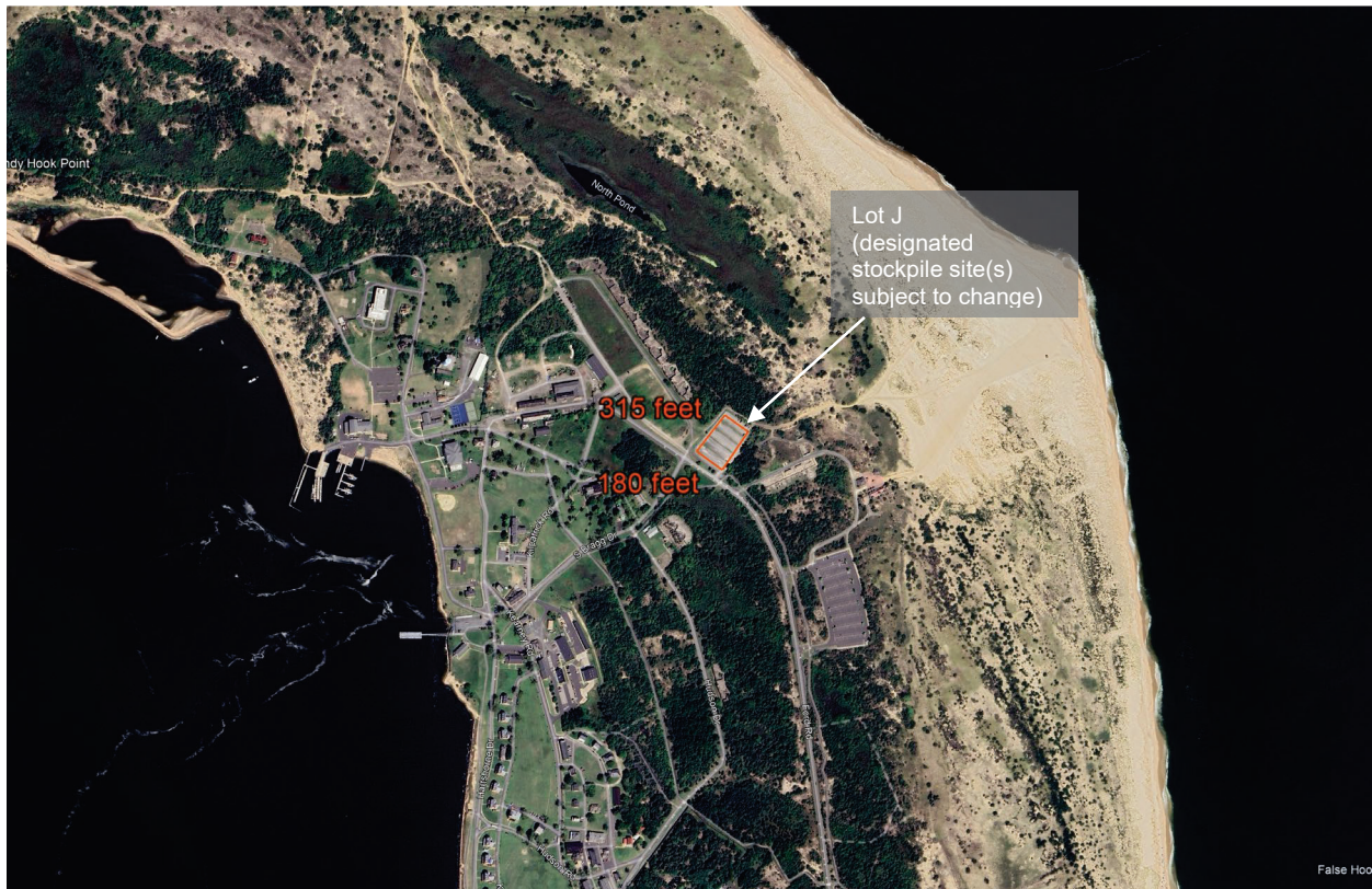
Figure 2: Lot J – NPS Sandy Hook Gateway National Recreation Area (Not to scale)