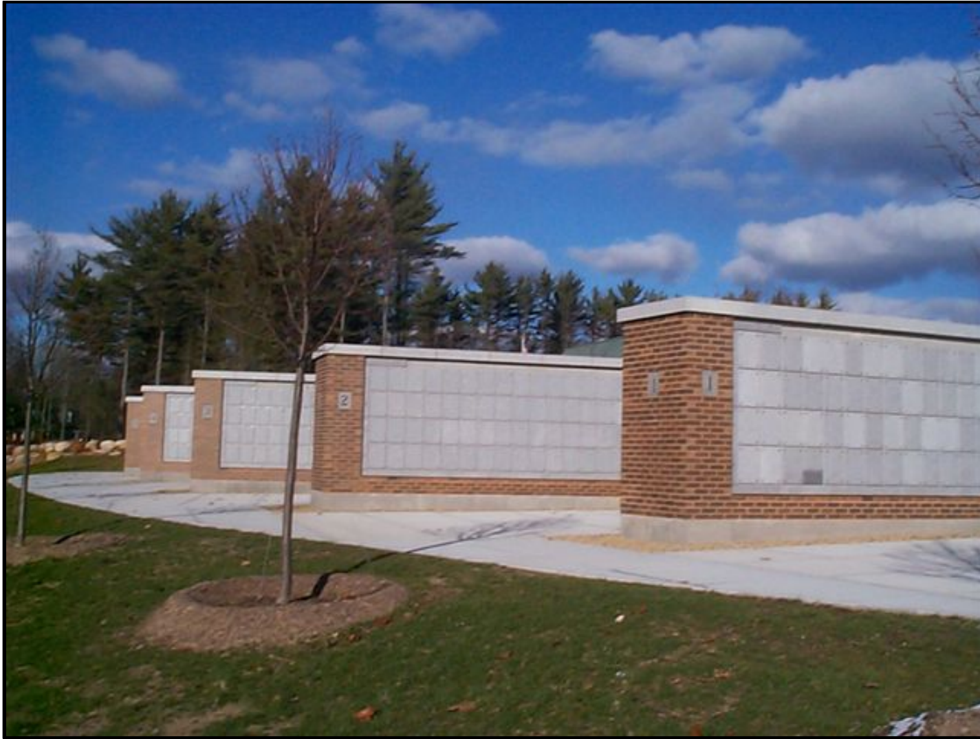
Figure 6: Examples of niche walls and niches.