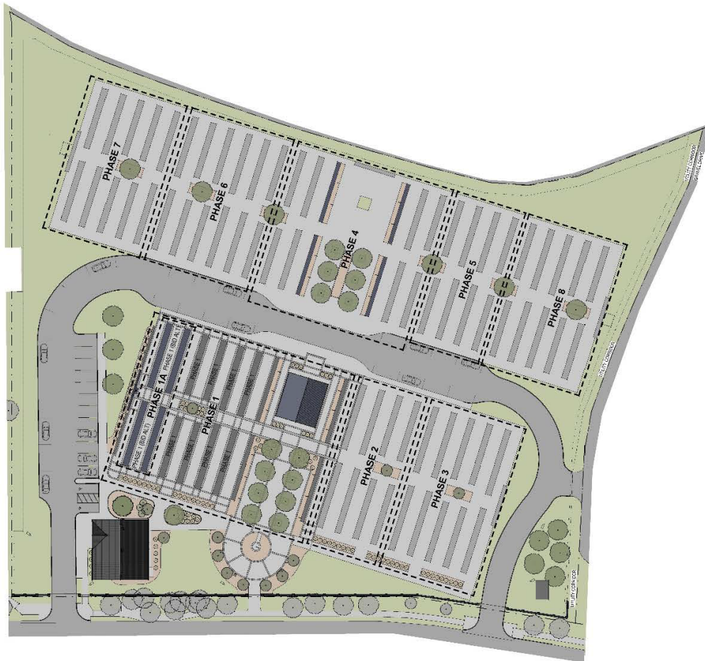
Master Site Plan – Niche Count Per Phase Site Plan – Niche Count Per Phase (all phases illustrated)