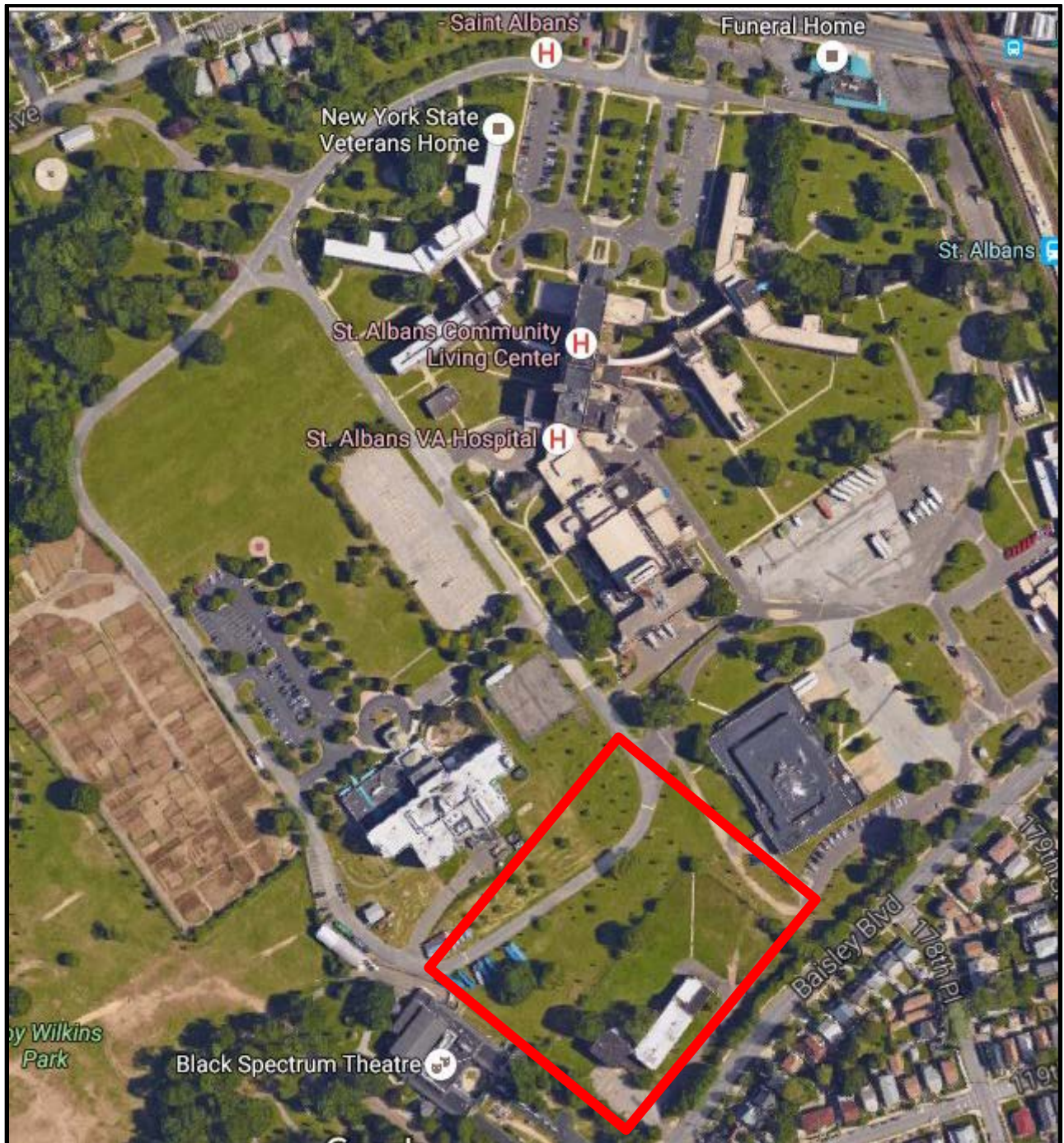
Figure 2: Aerial view of the St Albans Community Living Facility and the proposed location for the columbarium the lower center of the figure.