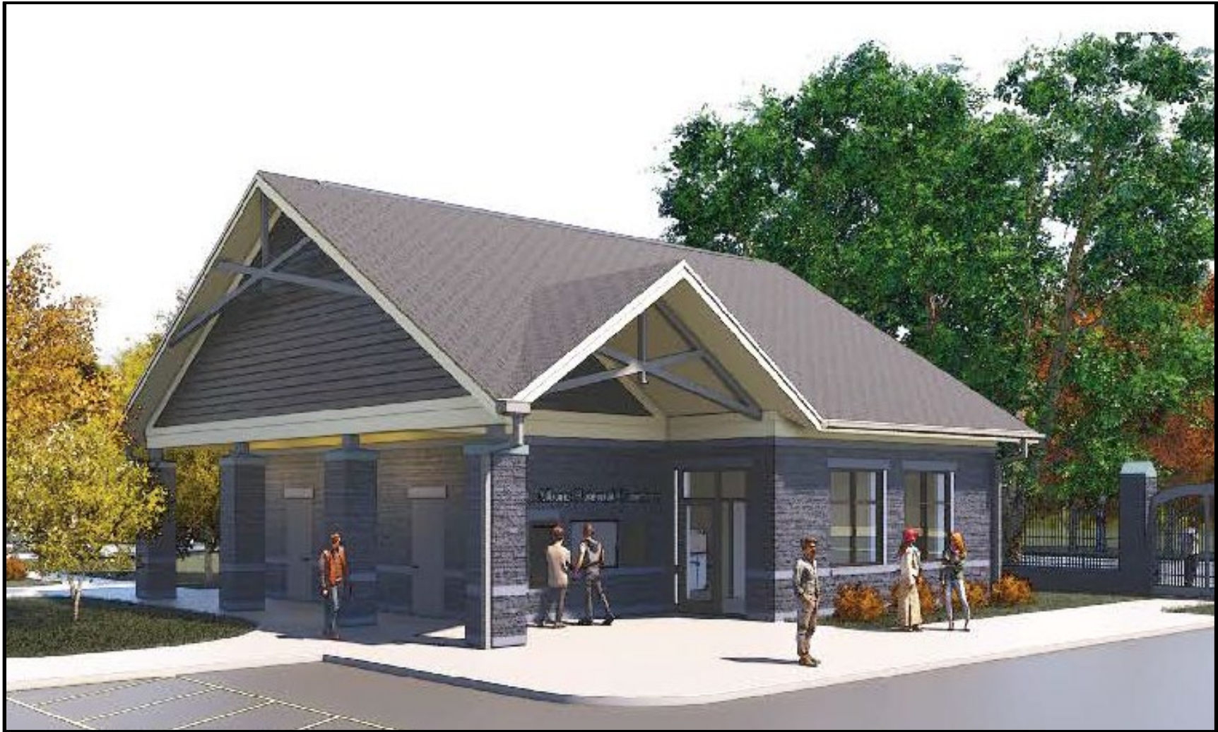
Figure 5: Conceptual drawing of the administration building/visitor center at entrance to columbarium.