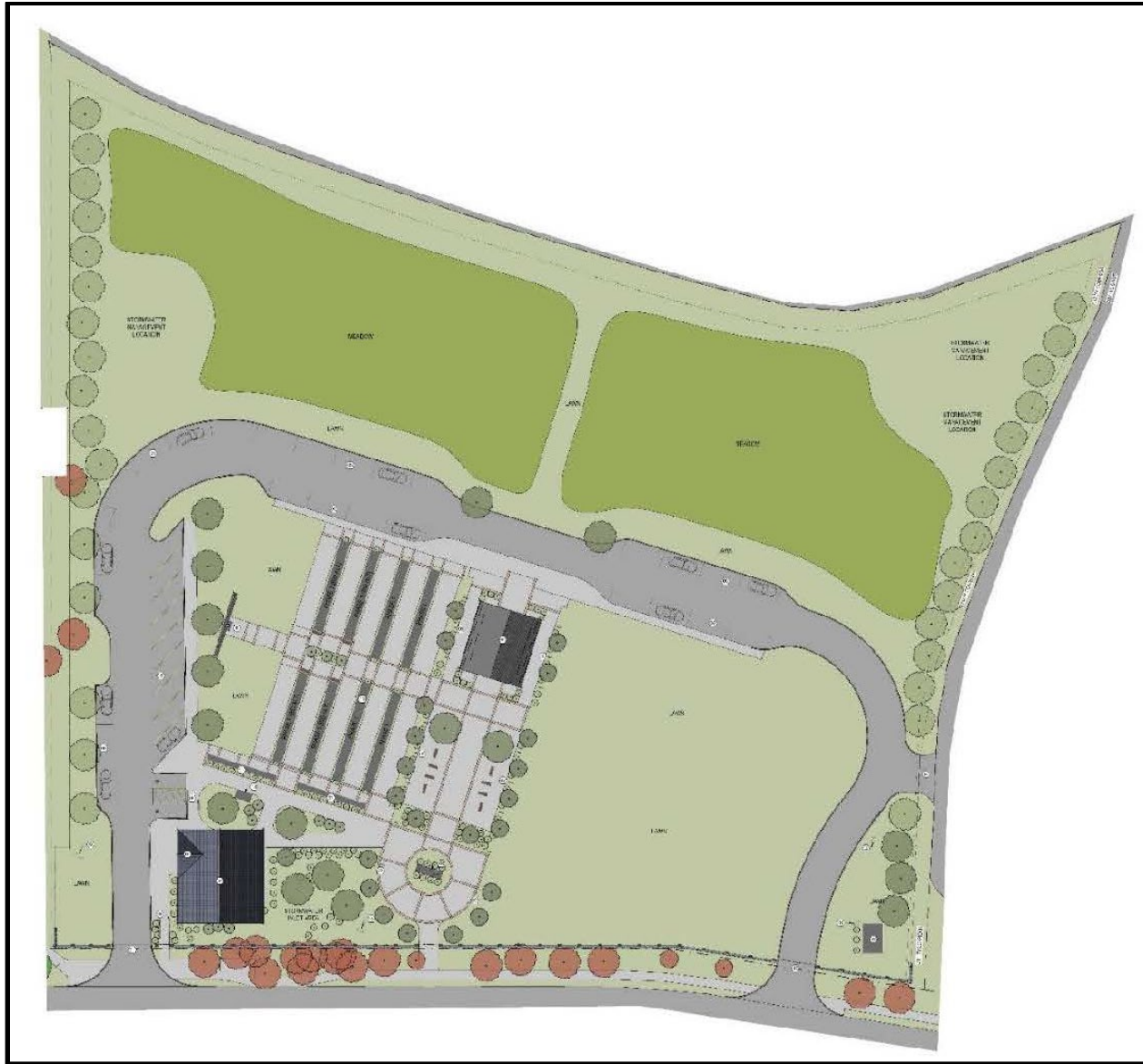
Figure 4: Phase 1, Selected Columbarium Concept.