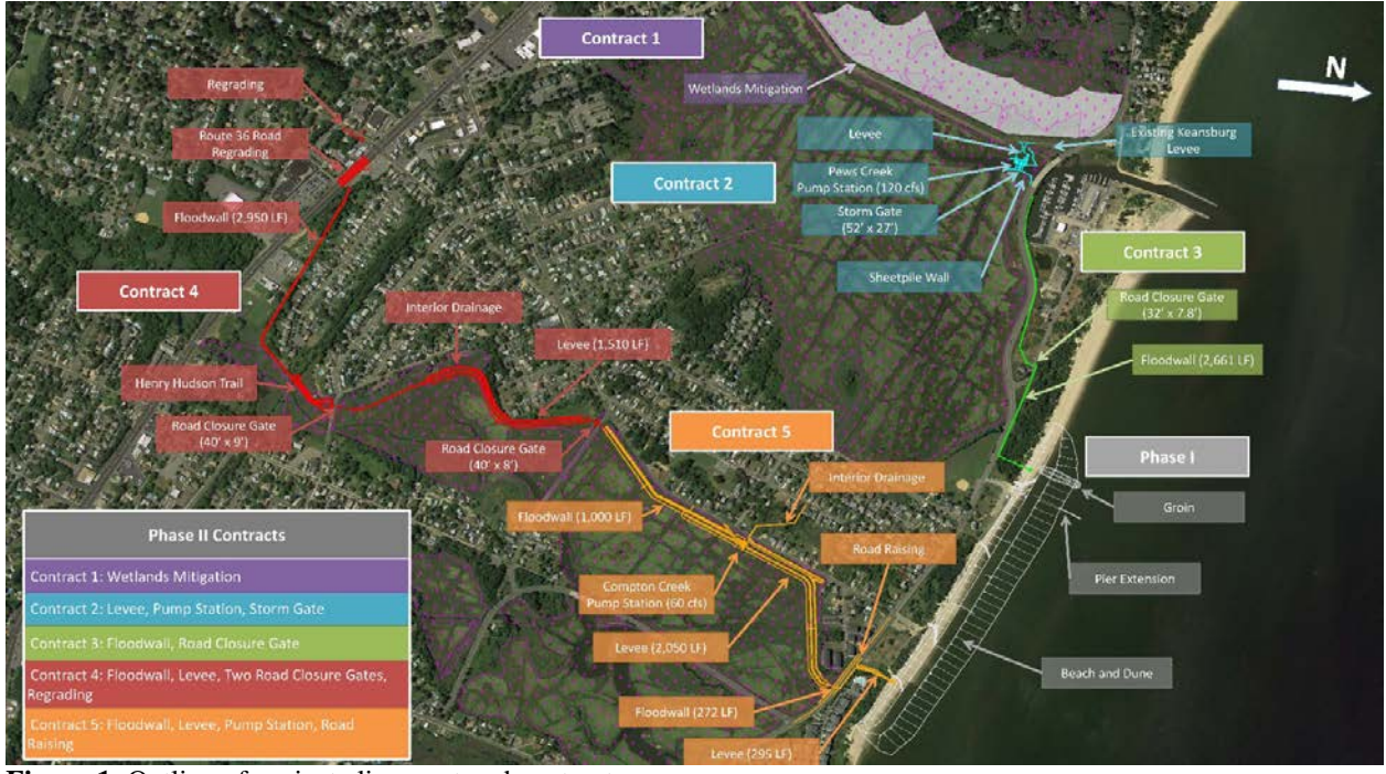
Figure 1: Outline of project alignment and contract areas.

The first phase of the project included beach nourishment, construction of a groin and walkovers for beach access, and extension of a pier along the waterfront in Port Monmouth. National Environmental Policy Act (NEPA) compliance for Phase I was completed under separate documentation and construction is complete; therefore this phase is not evaluated in this document.