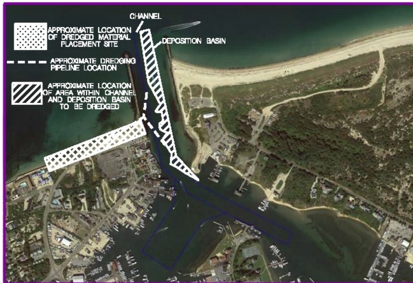
Figure 3: LMH Sand Placement Site

Construction duration, including removal of the sand from the channels to placing the sand on the beach, is anticipated to be no longer than between 60-90 days. No construction activities will occur between 1 January and 31 October of the year of construction.