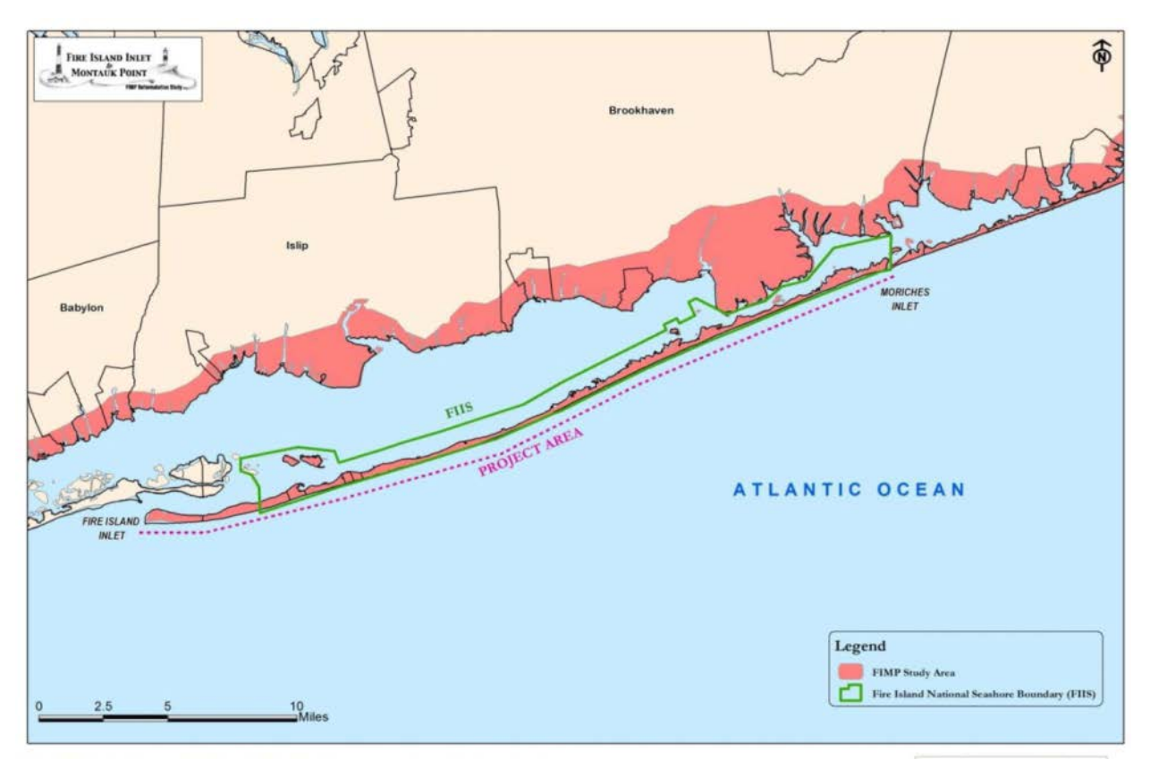
Figure 2. Map of FIMI Project Area. From U.S. Army Corps of Engineers (2014b).