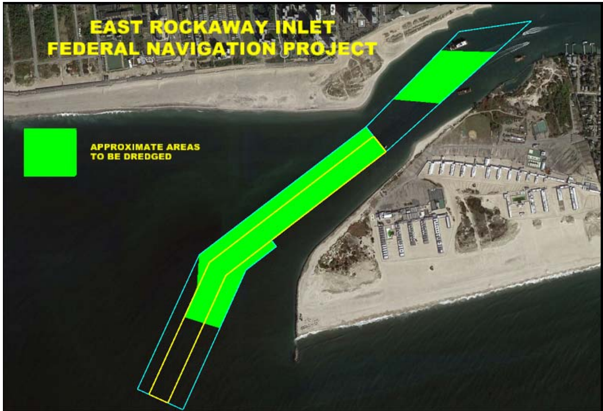
Image 1: East Rockaway Inlet, approximate locations of dredging areas shown (Google Earth Image Date: October 2014)