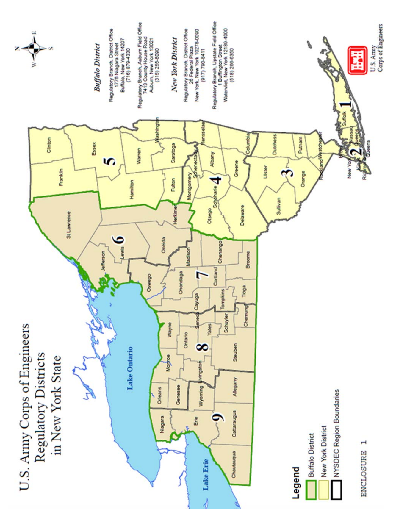
Final Regional Conditions, Water Quality Certification and Coastal Zone Concurrence for Nationwide Permit 8 – (Oil and Gas Structures on the Outer Continental Shelf) within the New York District Regulatory Boundary in the State of New York Expiration March 18, 2022