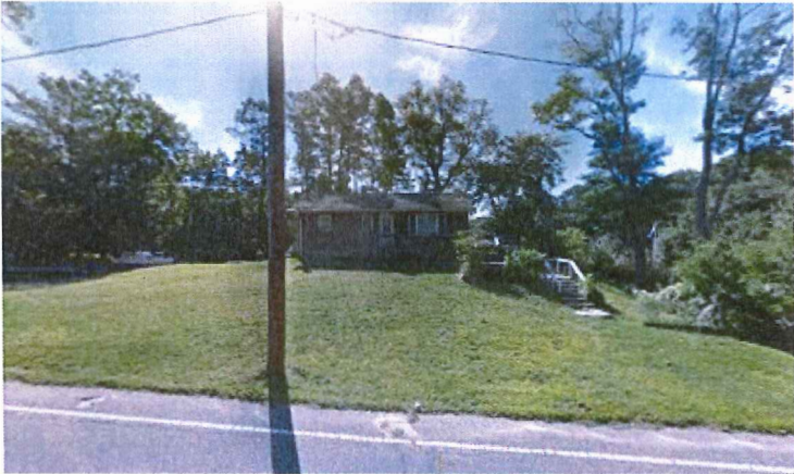
72 E Moriches Blvd Eastport, NY 11941