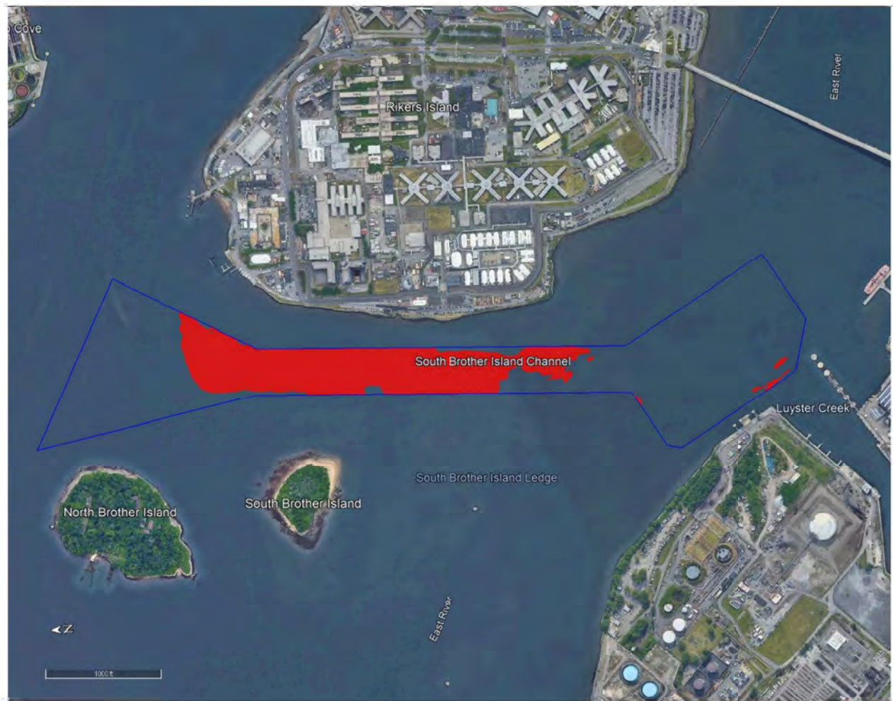
Figure 1: Proposed Dredging Area in East River, South Brother Island Channel, NY