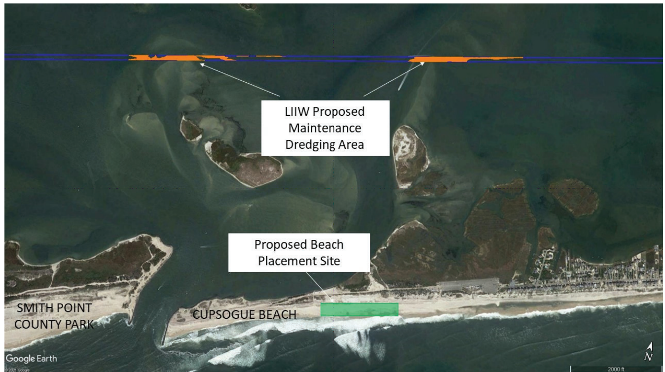
Figure 1: Dredging and Placement Location Map (Not to scale)