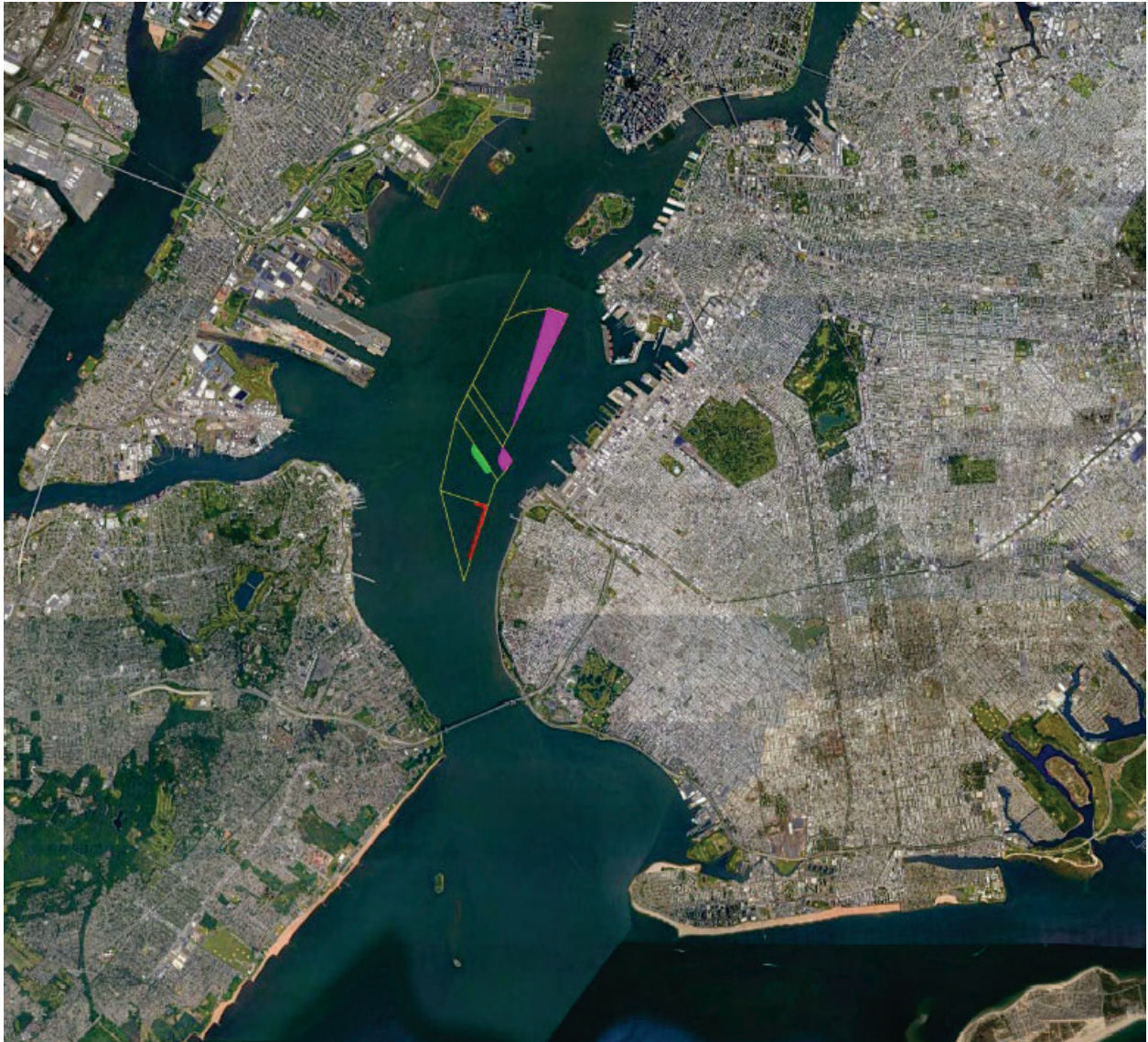
Figure 1: Proposed Dredging Area in Red Hook Flats Anchorage, New York Harbor, Anchorage