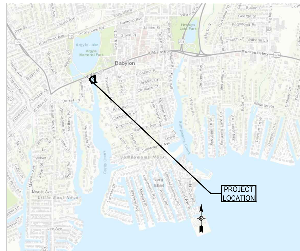
LOCATION MAP N.T.S.