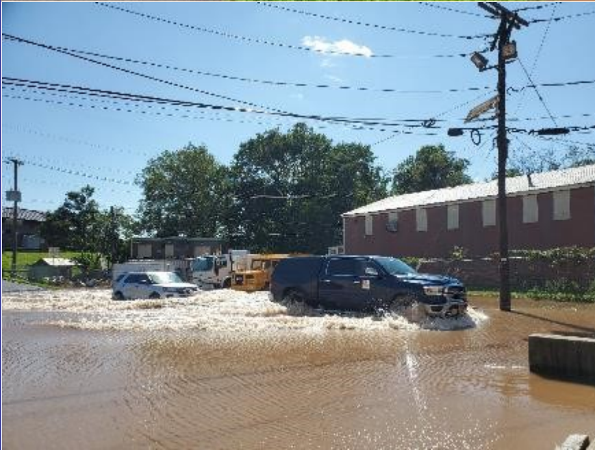
Pictured: Flooding during Tropical Storm Ida in September 2021.