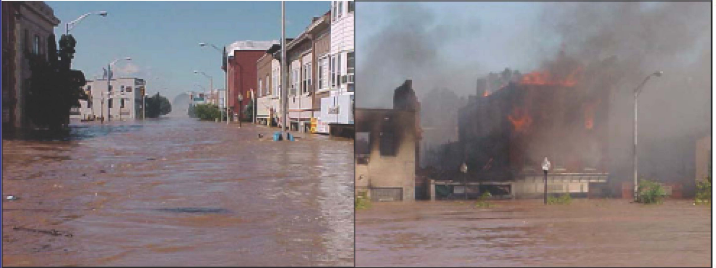
Pictured: Flooding during Tropical Storm Floyd in 1999.